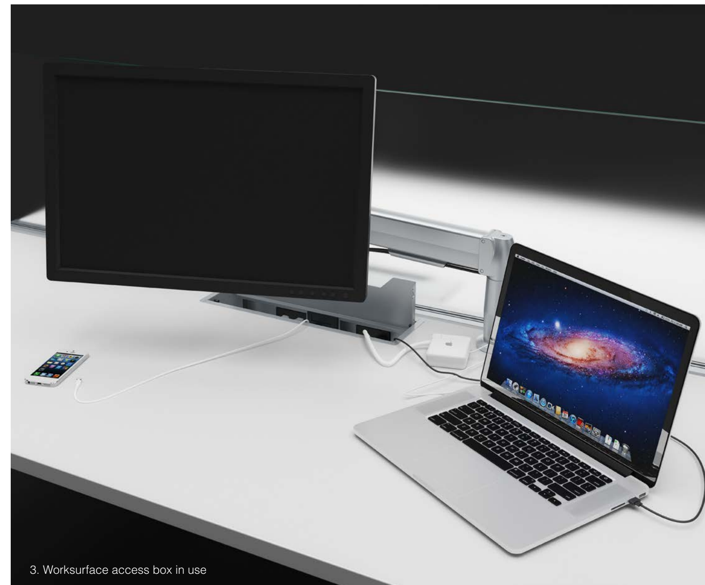
3. Workspace access box in use

1. Featured with standard 8-wire multi-circuit powerway. Also available with 10-wire multi-circuit option. Bench includes standard tiered wire management basket for routing electrical and data bundles separately.